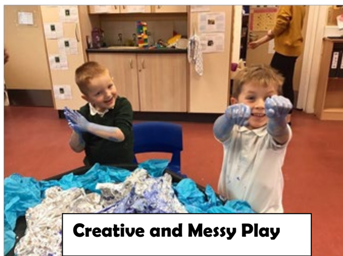
Creative and Messy Play