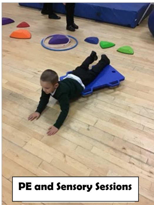
PE and Sensory Sessions

Here are somethings that happen in Oak Class!