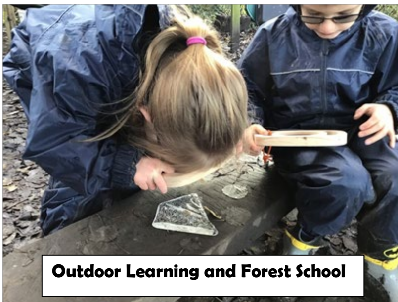
Outdoor Learning and Forest School