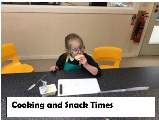
Cooking and Snack Times