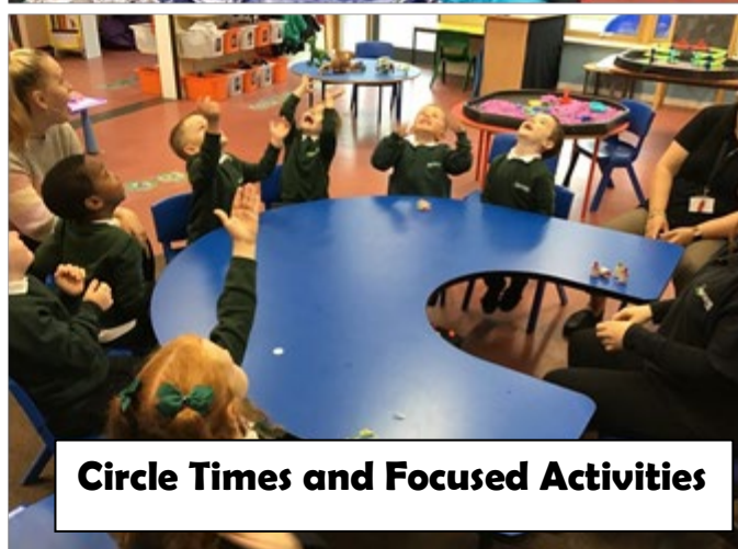
Circle Times and Focused Activities