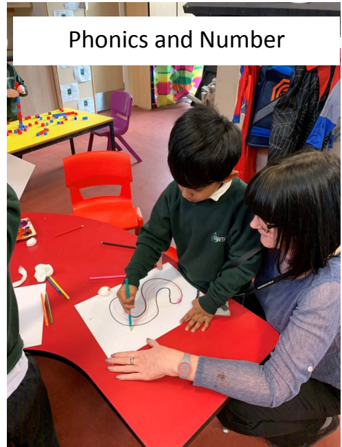
Phonics and Number