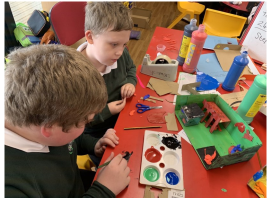
Art and D&T