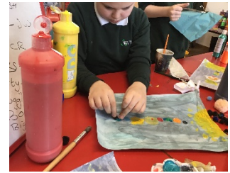
Art and D&T