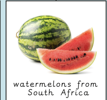
watermelons from South Africa