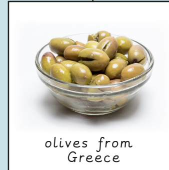
olives from Greece