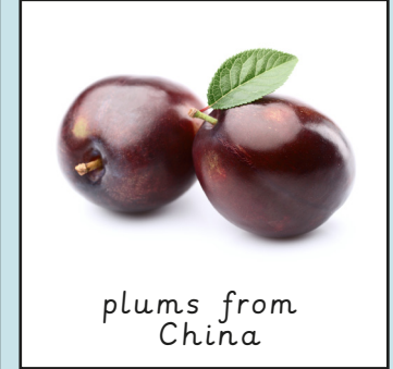
plums from China