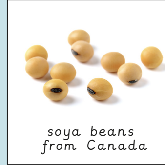
soya beans from Canada