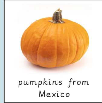
pumpkins from Mexico

Orange and yellow: vitamin A, vitamin C and fibre.