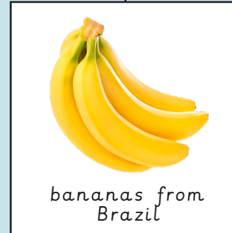
bananas from Brazil