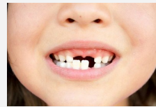
Loosing a tooth