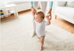
Learning to walk