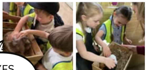
EYFS Farm Visit