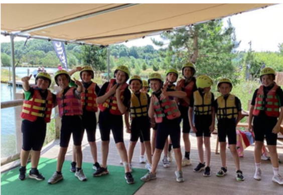
Year 6 at Spot on Wake

Parents are welcome to attend events highlighted in red.