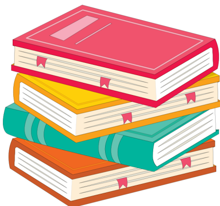
KS2 Parent Reading Workshop