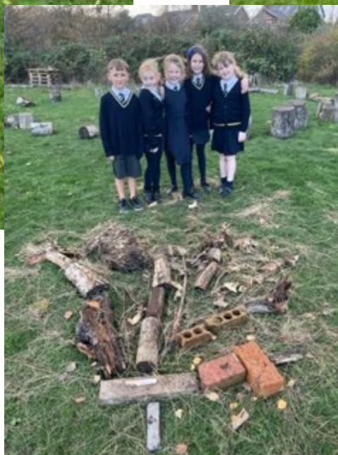
Next week Lancashire Wildlife Trust will begin working on improving our school grounds, more information to follow.