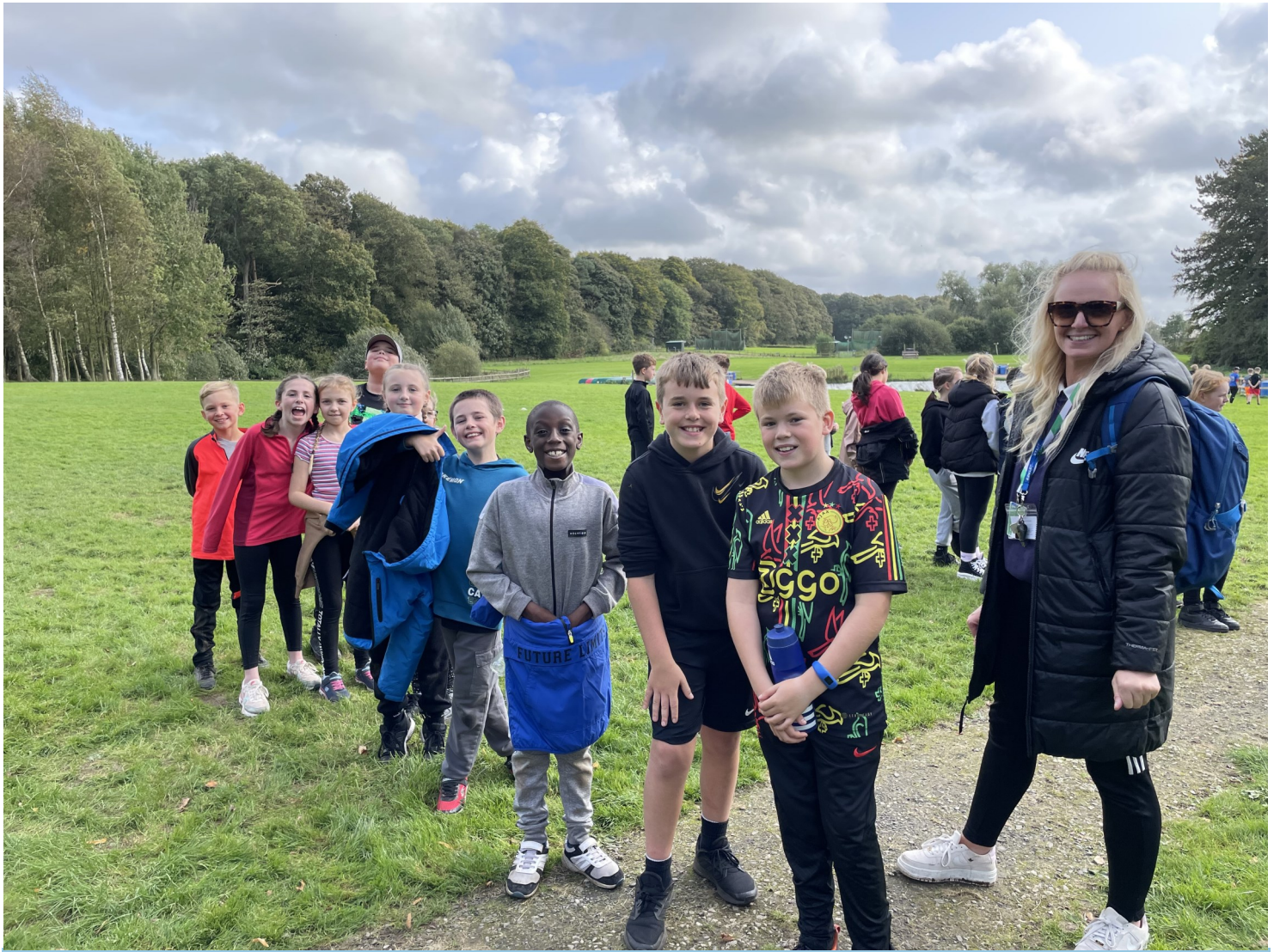
The children all had a great time with lots of different activities. Day 1 was dry, Day 2 was very wet, so by Day 3 they were very muddy as well as very tired! Still smiling though!