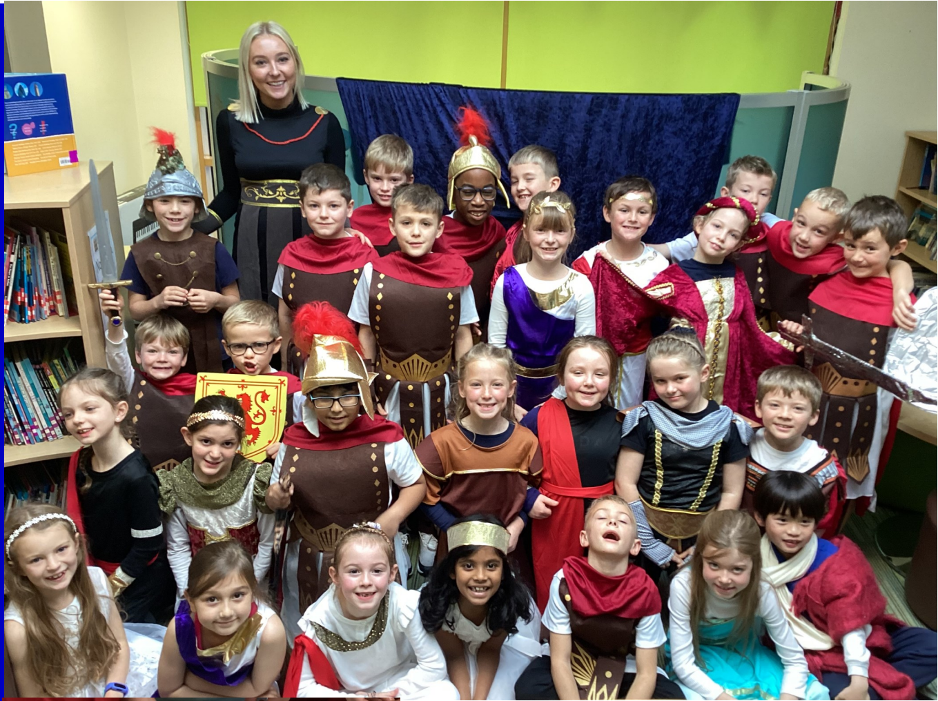
Year 3 had a wonderful Roman Day. They looked amazing and had great fun finding out about Roman Life.