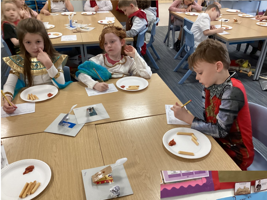
Roman Life and Drama.

Food tasting ready for the Roman Banquet– some interesting tastes but no stuffed dormice in sight!