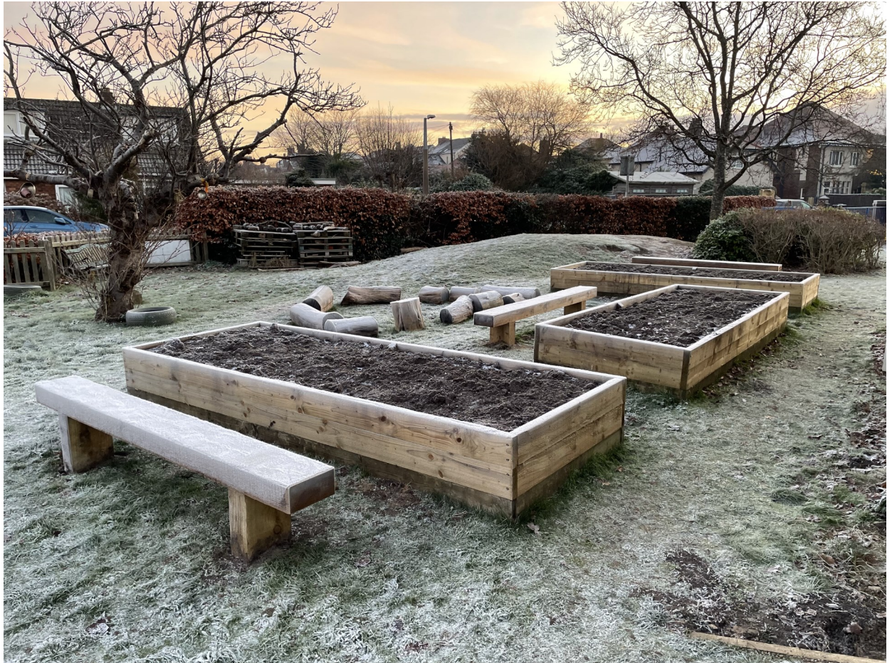
The allotments have been renewed and we will watch these develop in Spring. Den Building areas have also been developed.