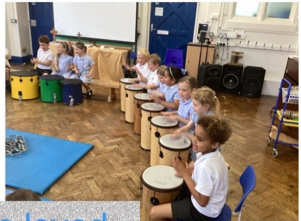
The children loved playing the drums.