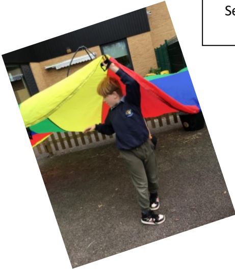
Sensory parachute play outside.