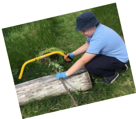
Fabulous Forest Schools!