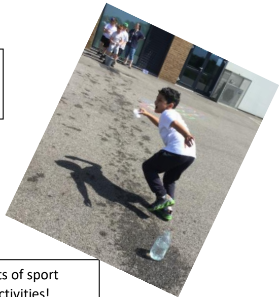
Lots of sport activities!