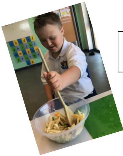
Developing independent skills in cooking.