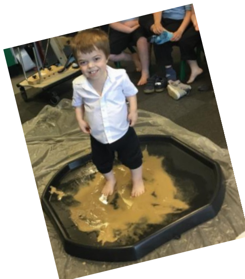
Sensory experiences on the beach.