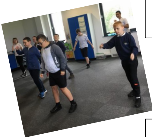
Let's get grooving! One of our favourite activities.