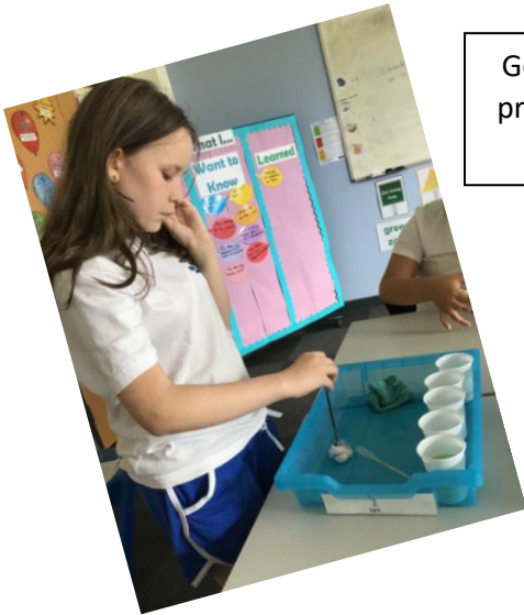
Getting creative and practising our tie dye skills.