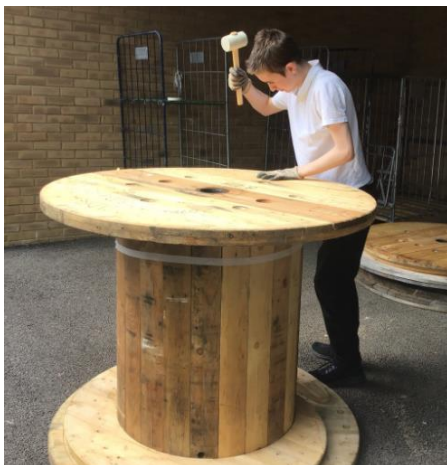
Preparing for the world of work.