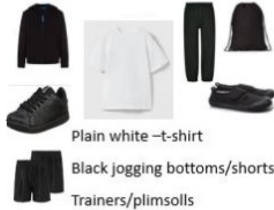
Plain white –t-shirt