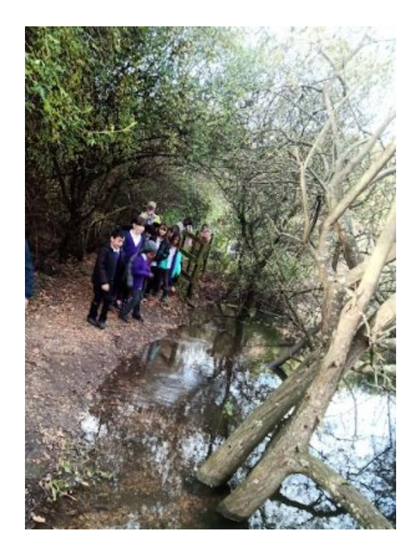
Year 4 Local River Walk

As part of their Geography work on rivers, Year 4 went to Belstead Brook to learn about the physical features of rivers. It was very muddy because of all the rain, but this has provided the perfect opportunity to learn about the effects of rivers flooding!