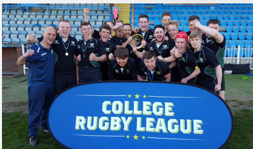
Yorkshire RFL College Cup Champions 2016