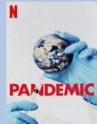
Pandemic: How to prevent an outbreak