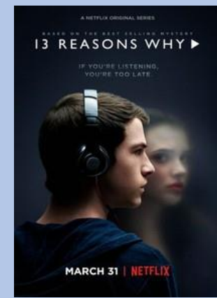
13 Reasons Why