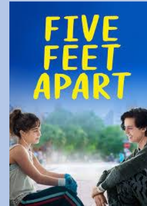
Five Feet Apart