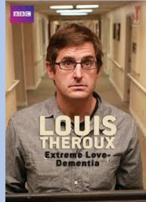
Louis Theroux: Extreme love, Dementia