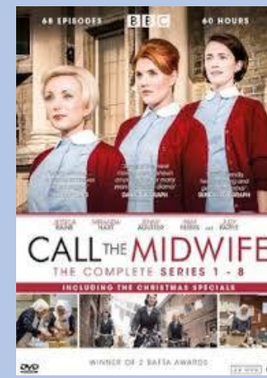
Call the Midwife