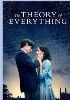
Theory of Everything