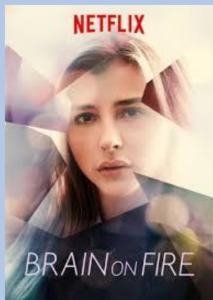
Brain on Fire