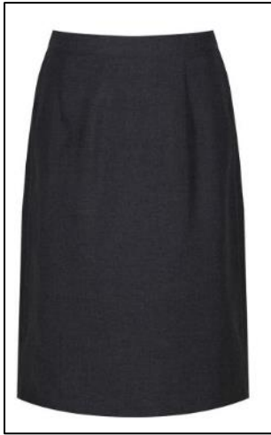
Back Vent Skirt

The style of skirts pictured below are not acceptable for school