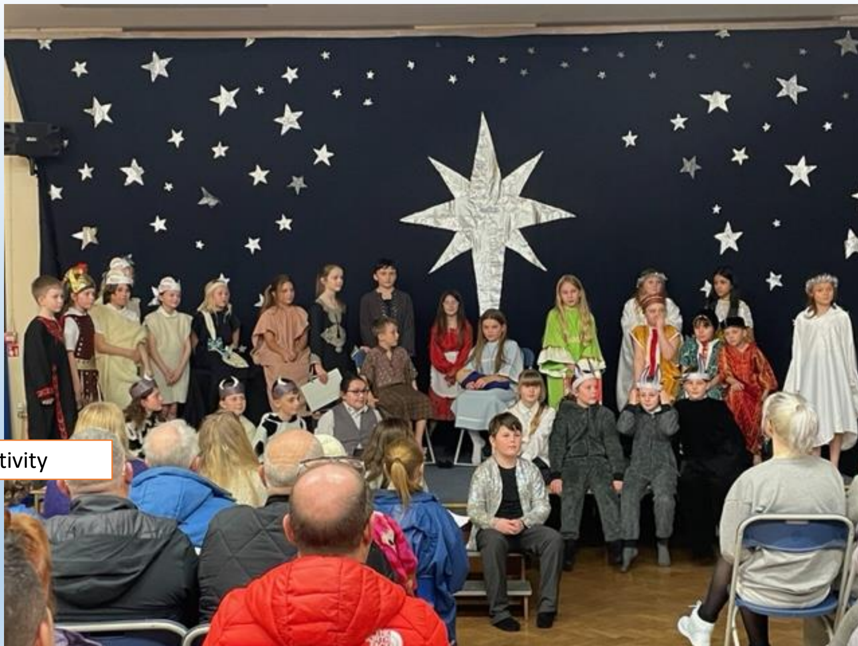
Year 5 Nativity