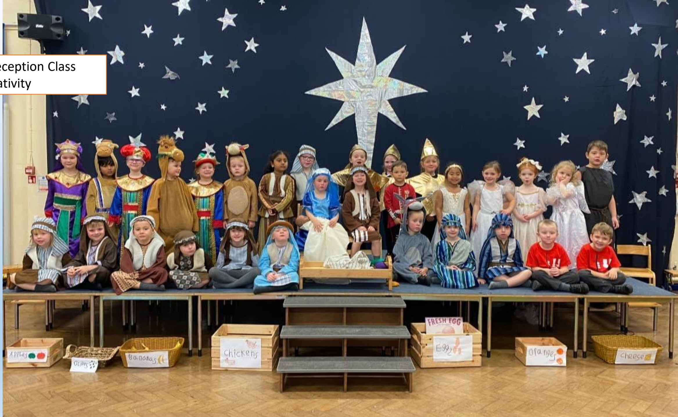
Reception Class Nativity