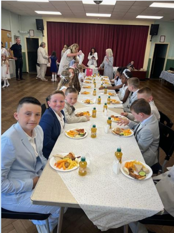
15 of our Year 4 pupils celebrated their first Holy Communion at Holy Family Church.