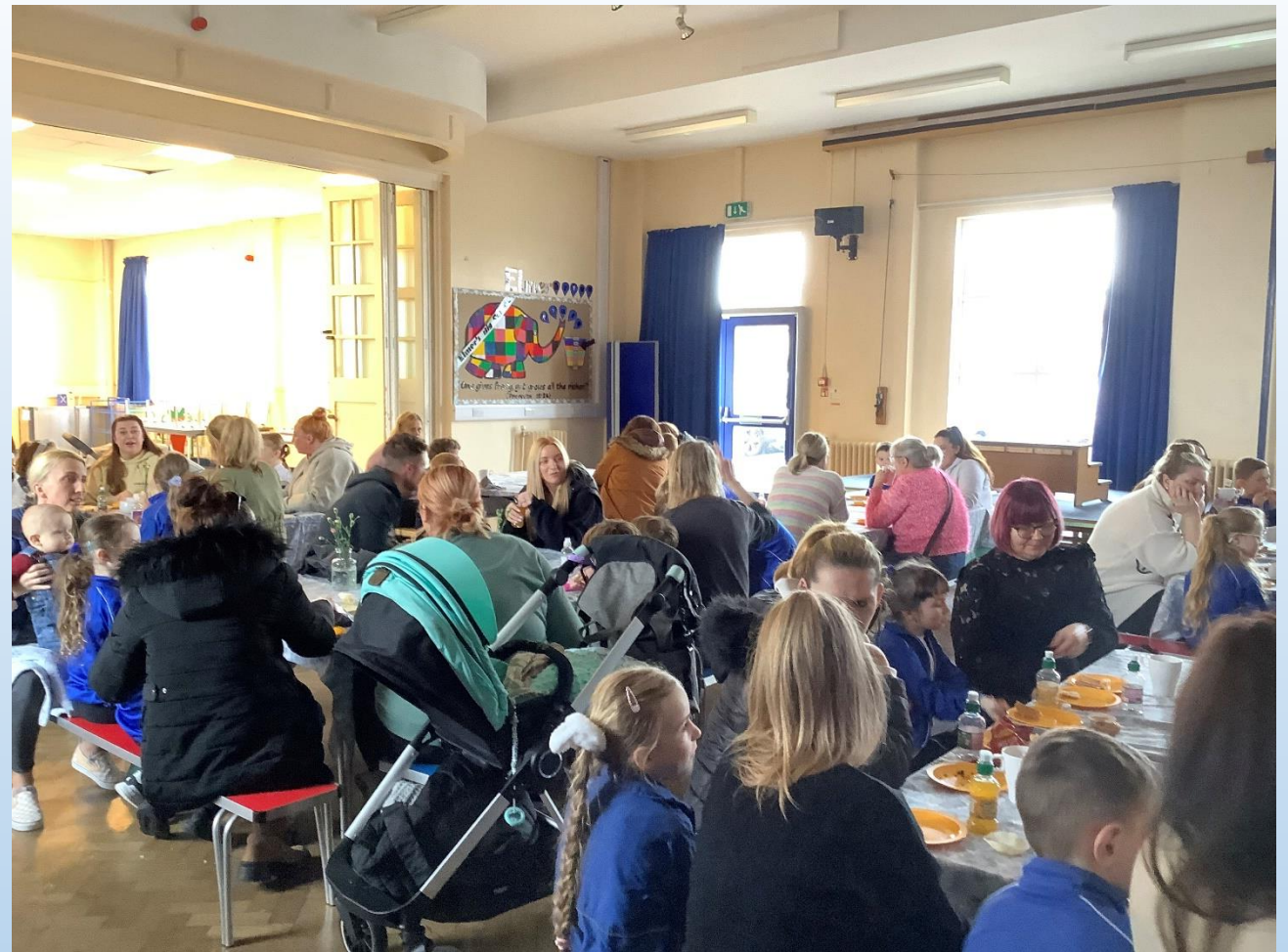
Choir and coffee event