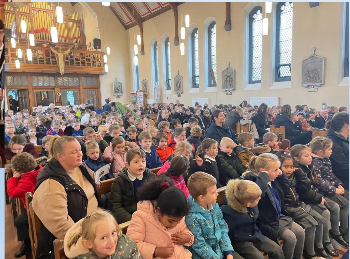
Working together – Park Christmas Carols