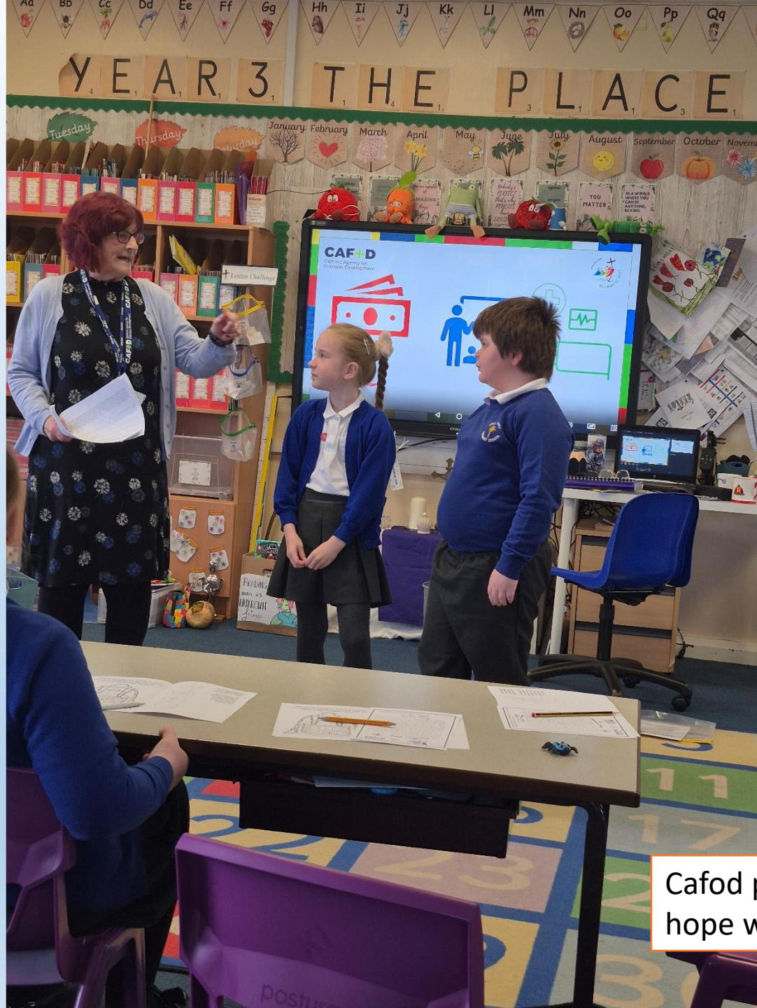
Cafod pilgrims of hope workshops