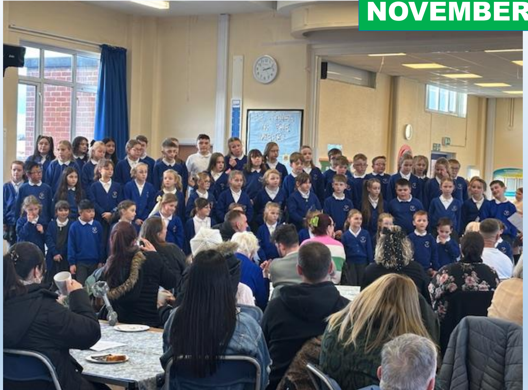
Choir and coffee event