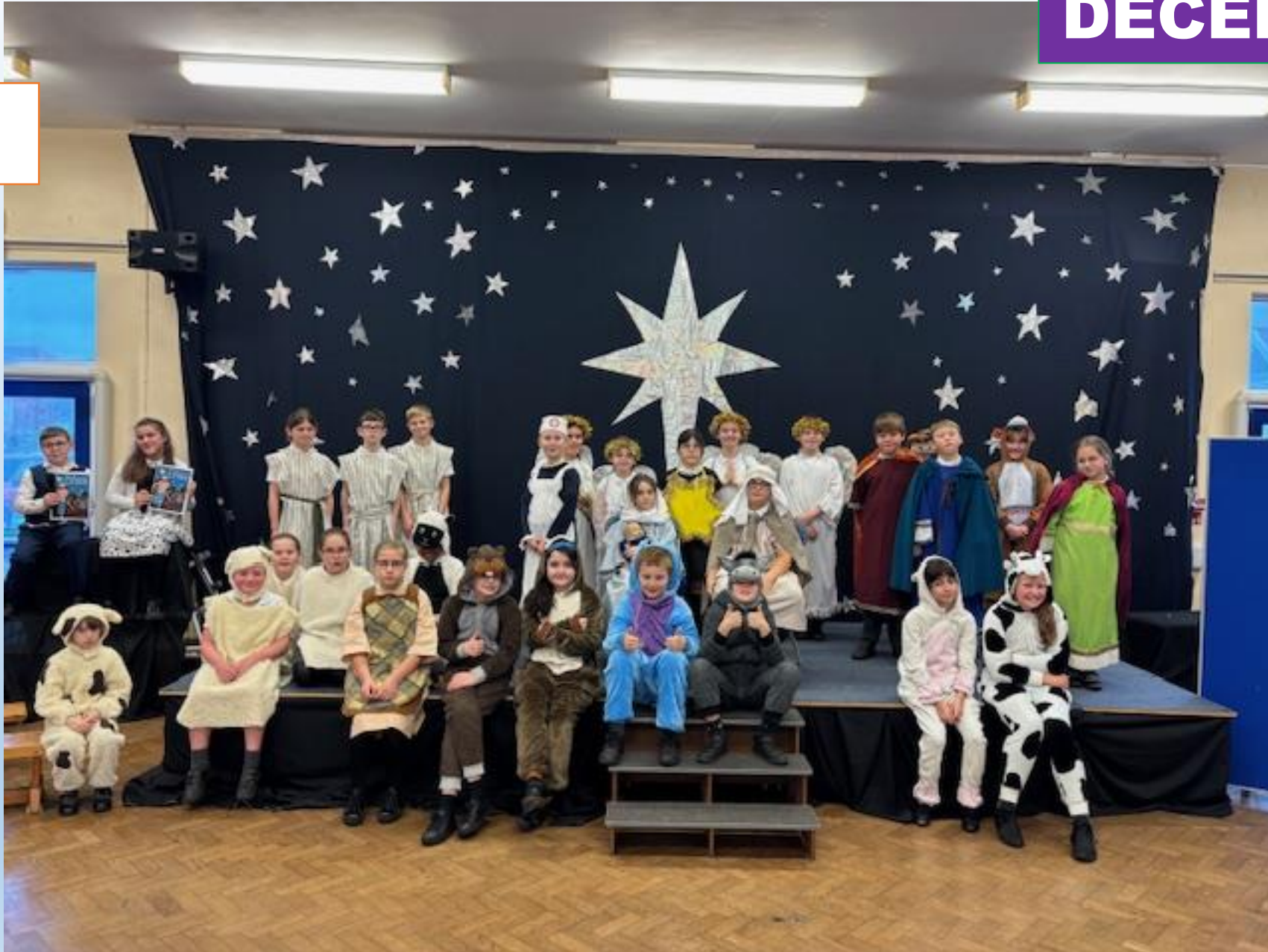
Year 5 Christmas Performance