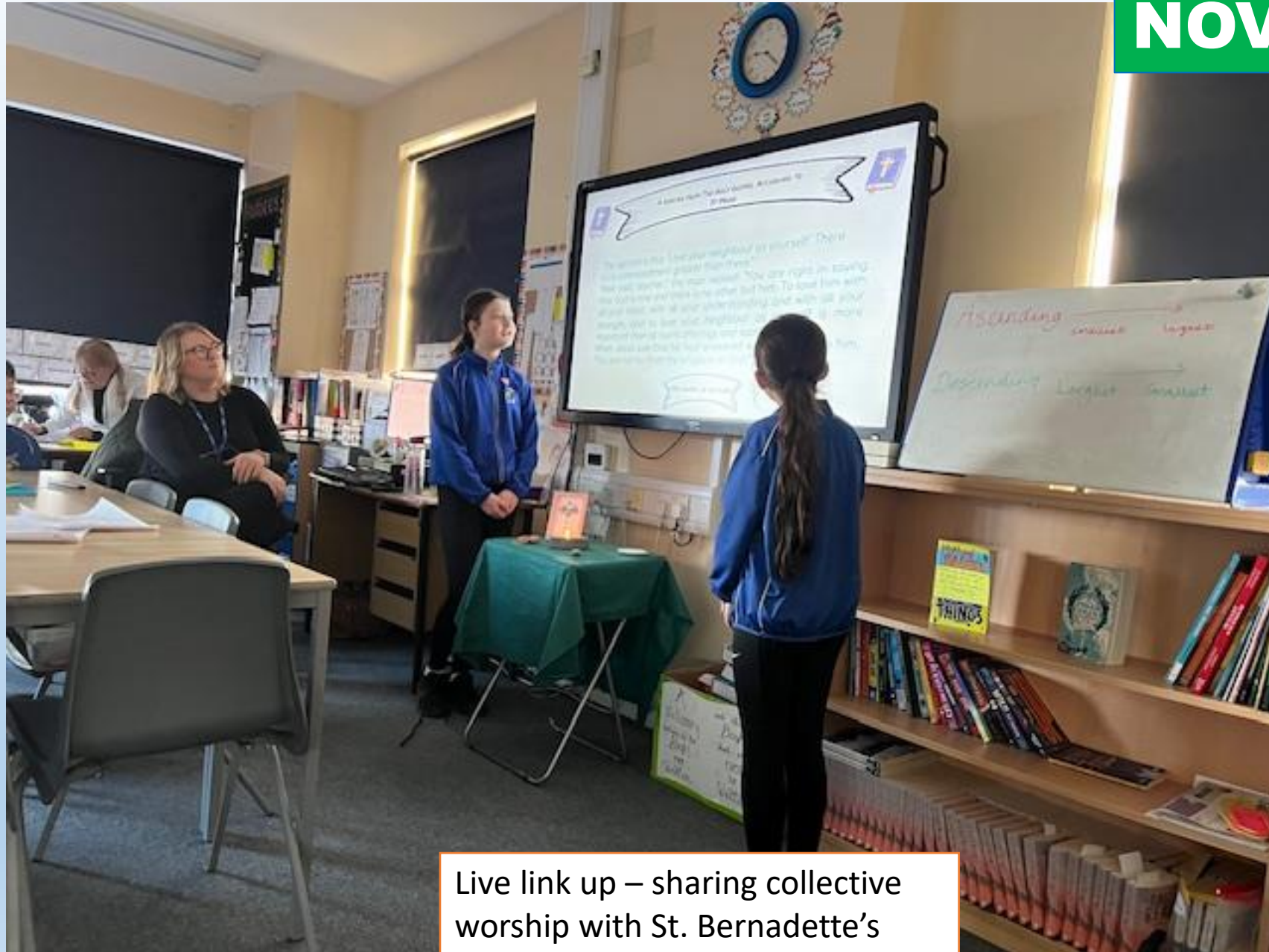
Live link up – sharing collective worship with St. Bernadette's