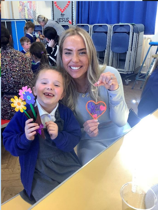
Mother's day crafting event