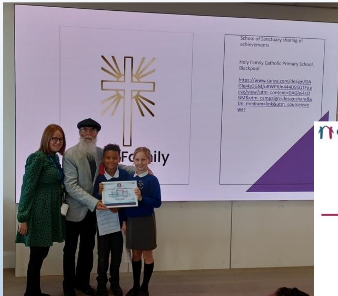
School of Sanctuary Presentation and accreditation