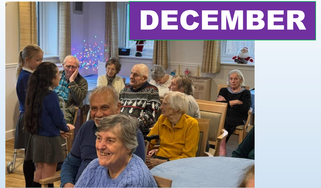
Our choir visited Primrose House care home to spread Christmas cheer