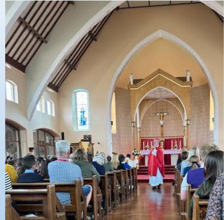
Deanery Jubilee and BEBCMAT jubilee celebration Mass at St. Wulstan's