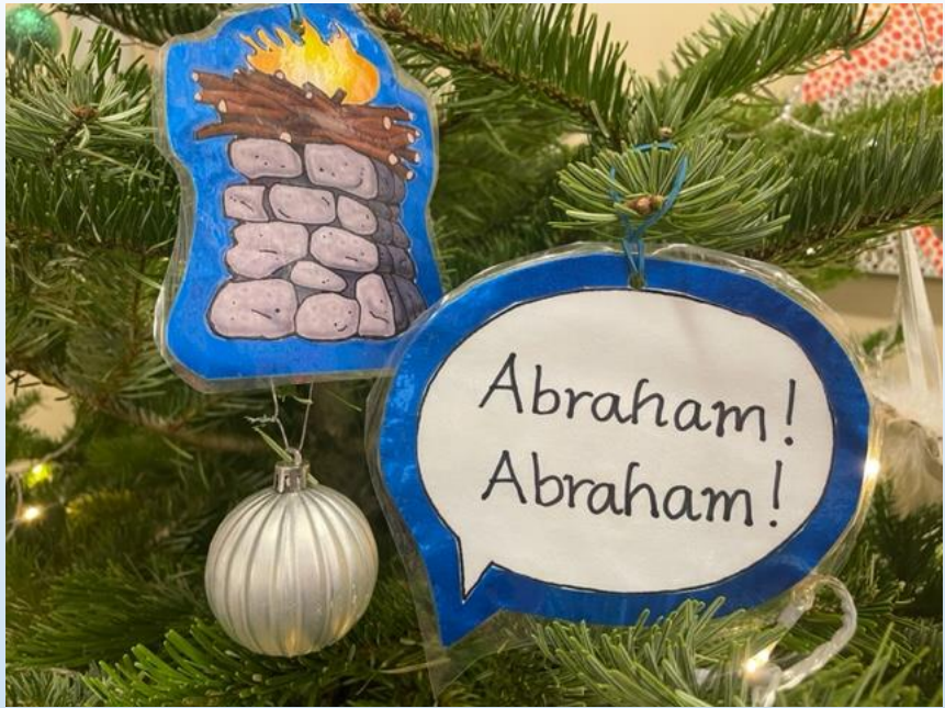
The Jesse Tree – preparing for Christ's birth