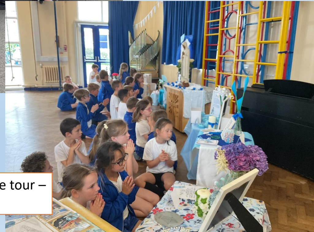
Our Lady of Lourdes Statue tour – special celebration day