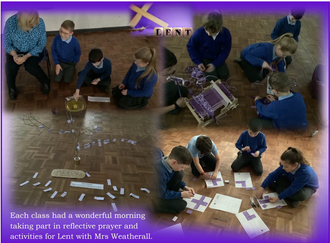
Each class had a wonderful morning taking part in reflective prayer and activities for Lent with Mrs Weatherall.