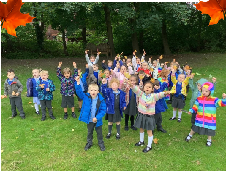
Reception Class have been busy exploring the field and woodland area looking for signs of Autumn.