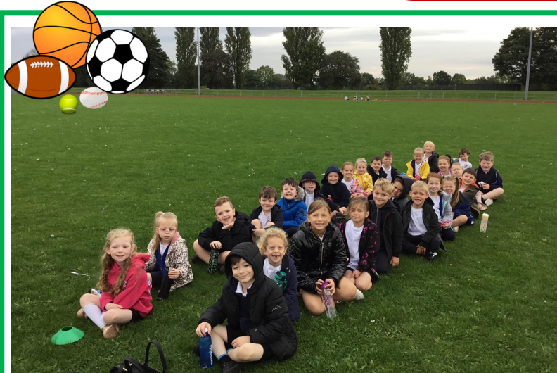
Our sporting calendar started this week. Children in Year 2 had a great time learning new skills at an event this week.

Please email the school office with your choice of password and then share it with family/friends whenever they collect your child. Thank you for your support!