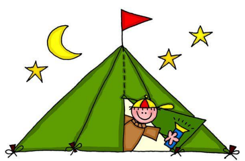
Straight after the disco! (Pitch your tent from 3pm)