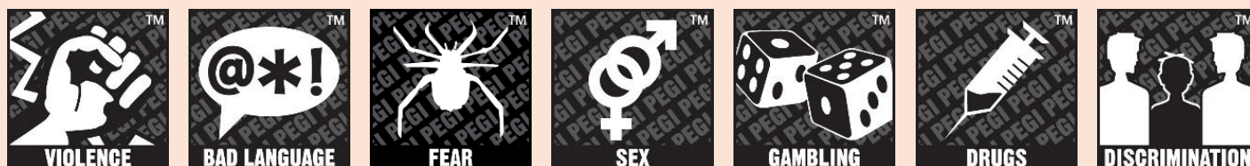
PEGI Content Descriptors (in order of incidence (l-r))

Despite what some children may have us believe (!), the age ratings given to individual games do not relate to skill levels required or the difficulty of the game but, to its suitability for a given age. Some example age ratings for popular games include those shown in the illustration below: