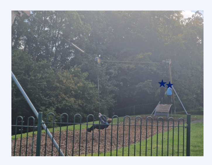
Follow us on X (formerly known as Twitter) for regular updates: @InspireAcademy9