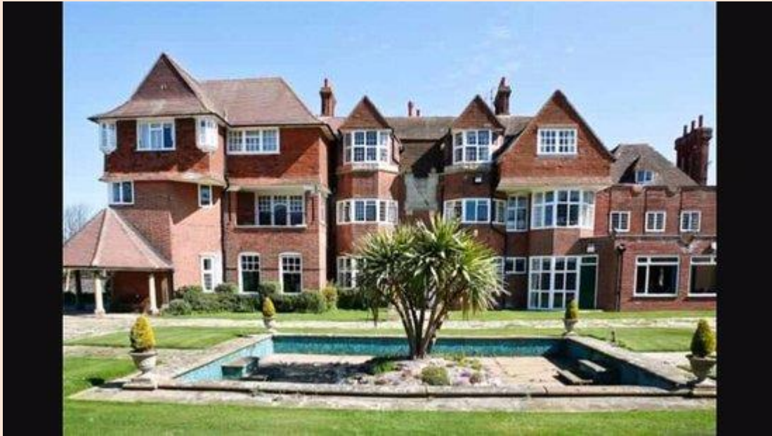
The Pleasance, Overstrand, Norfolk