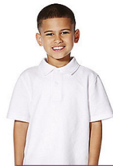
White or purple polo shirt or shirt

In summer children may wear a sun hat of their choice.