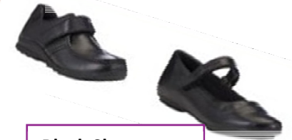
Black Shoes or black trainers