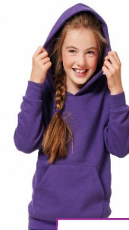
Purple jumper, hoody or cardigan with school logo