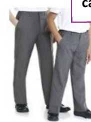
Grey / black dress / skirt or trousers