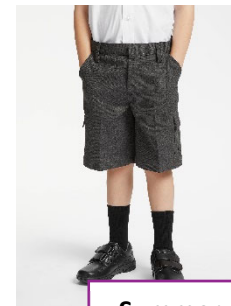
Summer grey or black shorts