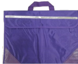
Reading book bag (purple with Jericho logo (optional))