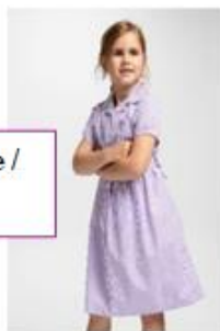
Summer dress – purple / white check