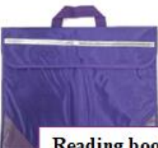
Reading book bag (purple with Jericho logo (optional))