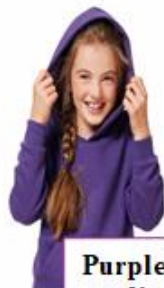
Purple jumper, hoody or cardigan with school logo