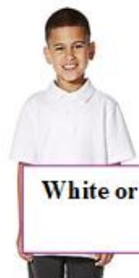
White or purple polo shirt or shirt