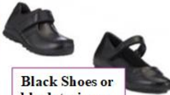
Black Shoes or black trainers