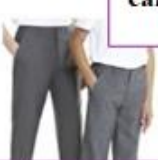
Grey / black dress / skirt or trousers