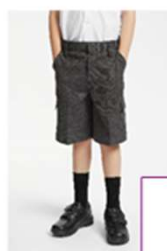
Summer grey or black shorts