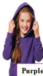
Purple jumper, hoody or cardigan with school logo