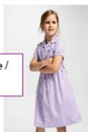
Summer dress – purple / white check