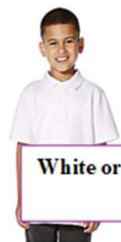
White or purple polo shirt or shirt