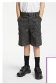
Summer grey or black shorts