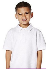
White or purple polo shirt or shirt

In summer children may wear a sun hat of their choice.