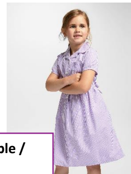
Summer dress – purple / white check