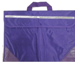
Reading book bag (purple with Jericho logo (optional))