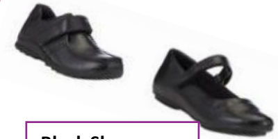
Black Shoes or black trainers