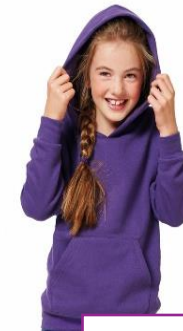
Purple jumper, hoody or cardigan with school logo