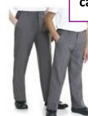
Grey / black dress / skirt or trousers