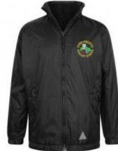
John Perryn Reversible Jacket