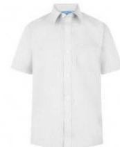
Boys Short Sleeve School Shirts- White