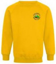
John Perryn Nursery Sweatshirt