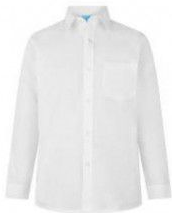
Boys Long Sleeve School Shirt- White