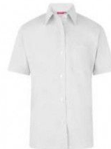
Girls Short Sleeve School Blouse- White