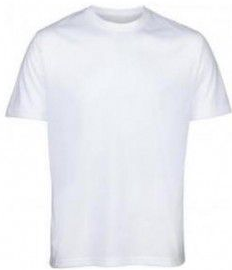
Plain Round Neck T-Shirt