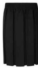
Box Pleat Skirt- Black