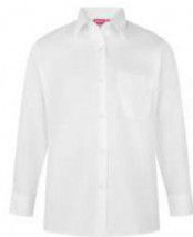
Girls Full Sleeve Blouse- White