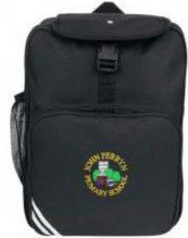
John Perryn Junior Backpack