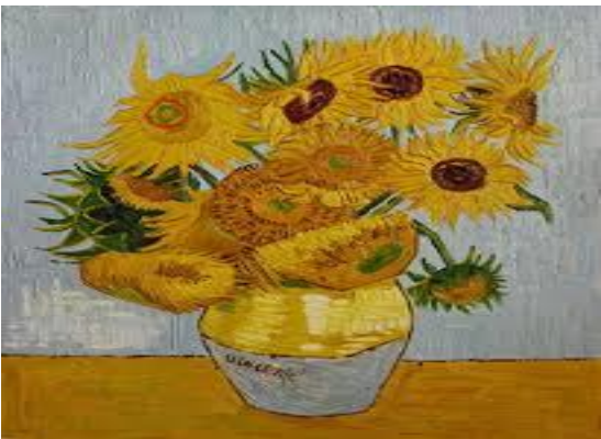
Vincent Van Gogh