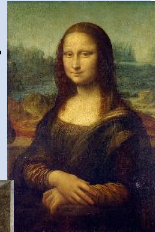
Mona Lisa (1503 - 1506)