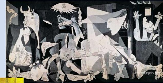
Above: Guernica (1937)