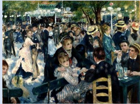
Ball at the Moulin de la Galette (1876)