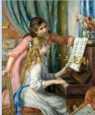
Girls at the Piano (1892)