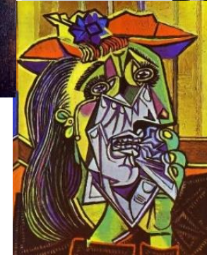
Left: The Weeping Woman (1937)