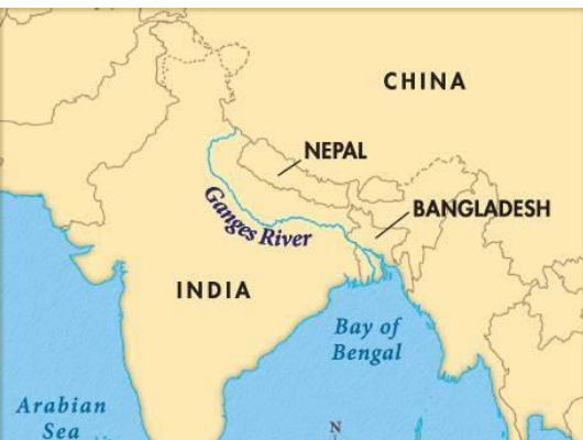
River Ganges - river bordering India and Bangladesh