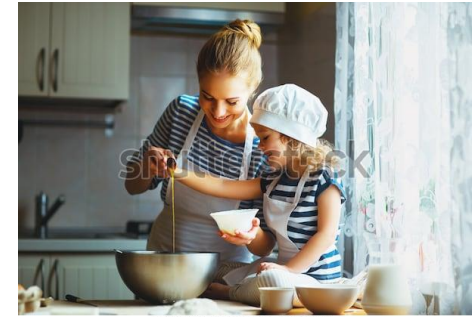
Have fun exploring maths