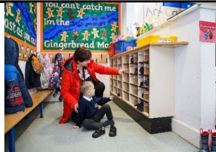
Support your child to do things by themselves