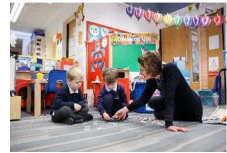
Encourage your child to talk and play with others