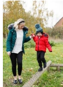
Enjoy physical activities together