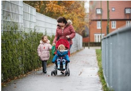
Communicate and talk with your child