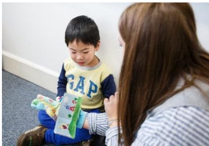
Read, tell and make up stories together