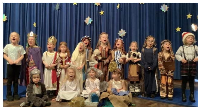
EYFS – The First Nativity

Christmas Nativities - Each class retold their own version of the Christmas story to parents and did an incredible job...so confident and professional!