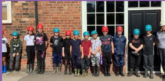
Standon Bowers 2024

In Mice, we have been learning about ourselves. We have been thinking about our faces and our eye and hair colour. Look at our portraits we have done using paint and mirrors to see what our features are 😊