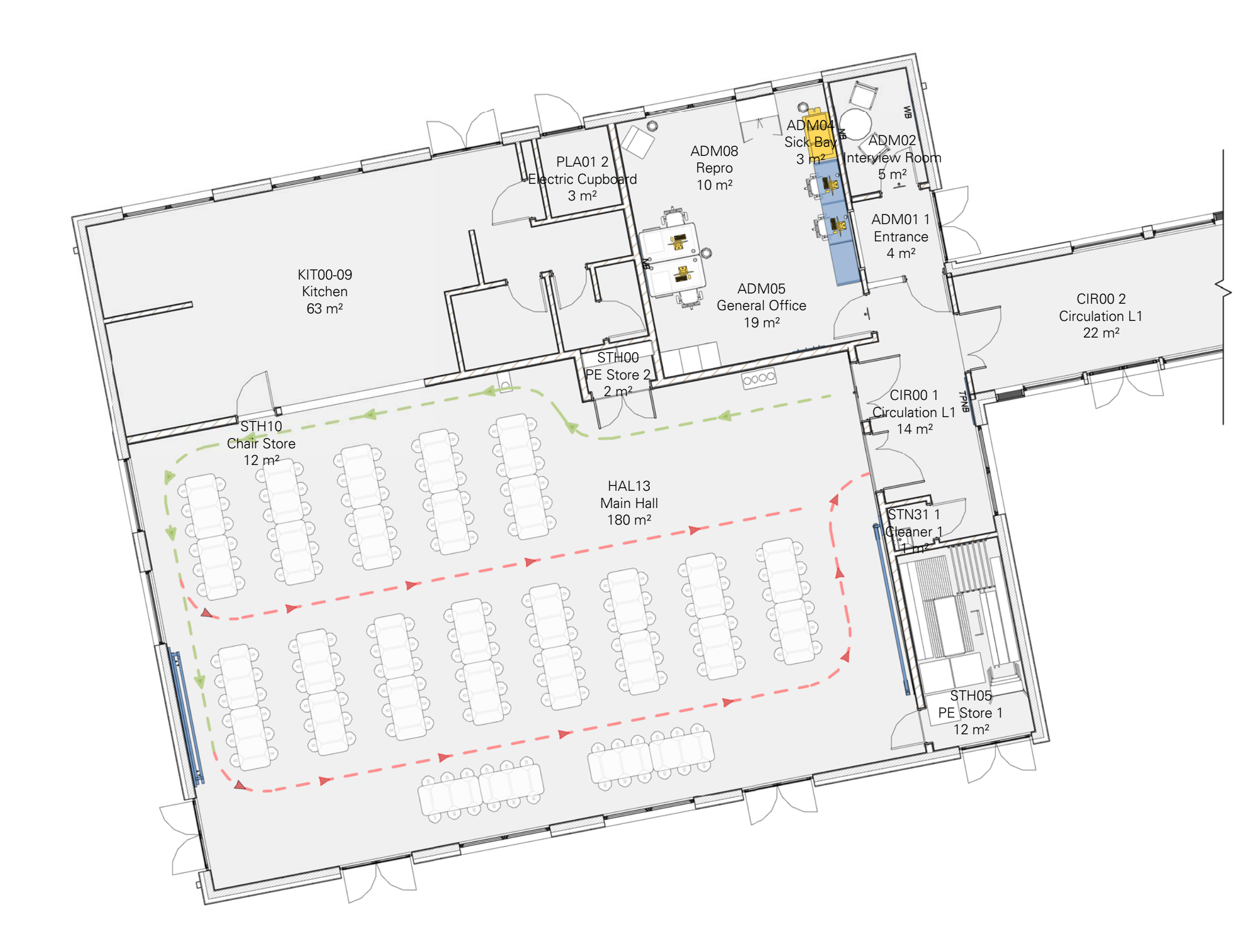
00 - Ground Floor Block A