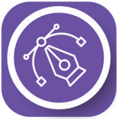
GRAPHIC DESIGN & MULTIMEDIA