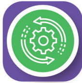
DESIGN & MANUFACTURING