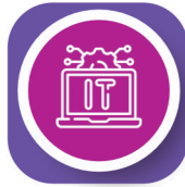
IT, SOFTWARE & COMPUTERS