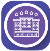
HOSPITALITY & TOURISM