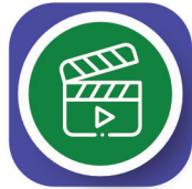
ENTERTAINMENT & MEDIA