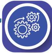
ENGINEERING & MANUFACTURING