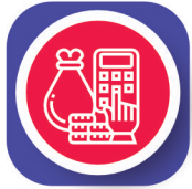
BUSINESS & FINANCE