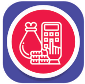
BUSINESS & FINANCE