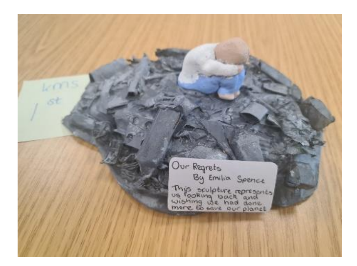
2<sup>nd</sup> place - Orson B