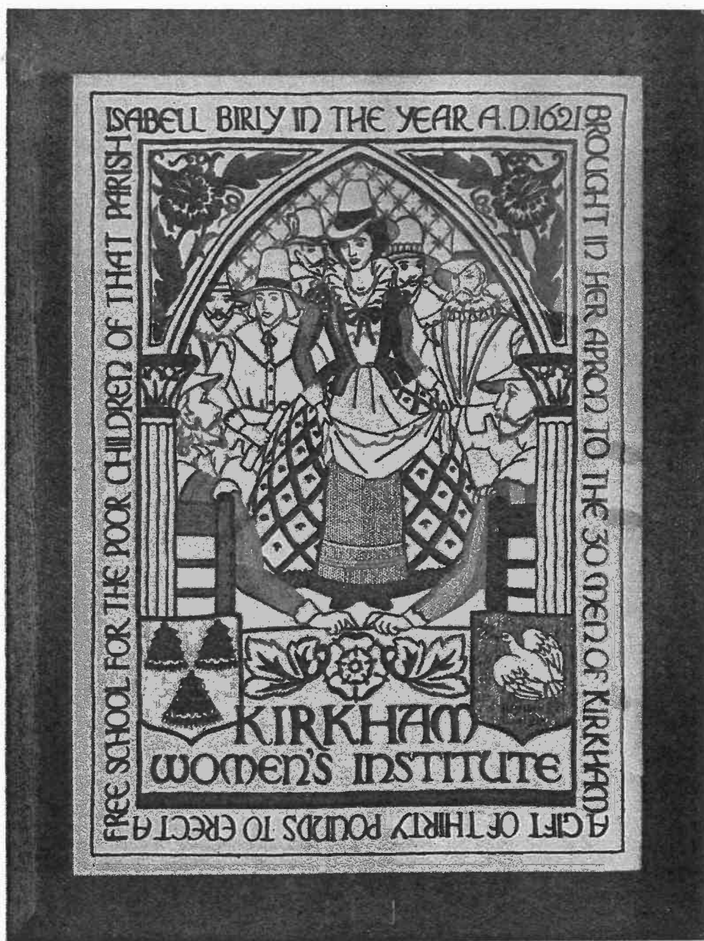
THE WORK AND GIFT OF THE KIRKHAM WOMEN'S INSTITUTE.

A needlework picture representing a Scene in the History of K.G.S.